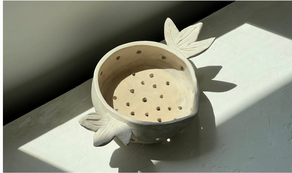
05 THE BERRY BOWL This fresh class is a fun summer staple and a twist on traditional pottery bowl classes. Push your creativity and create something original for your table!