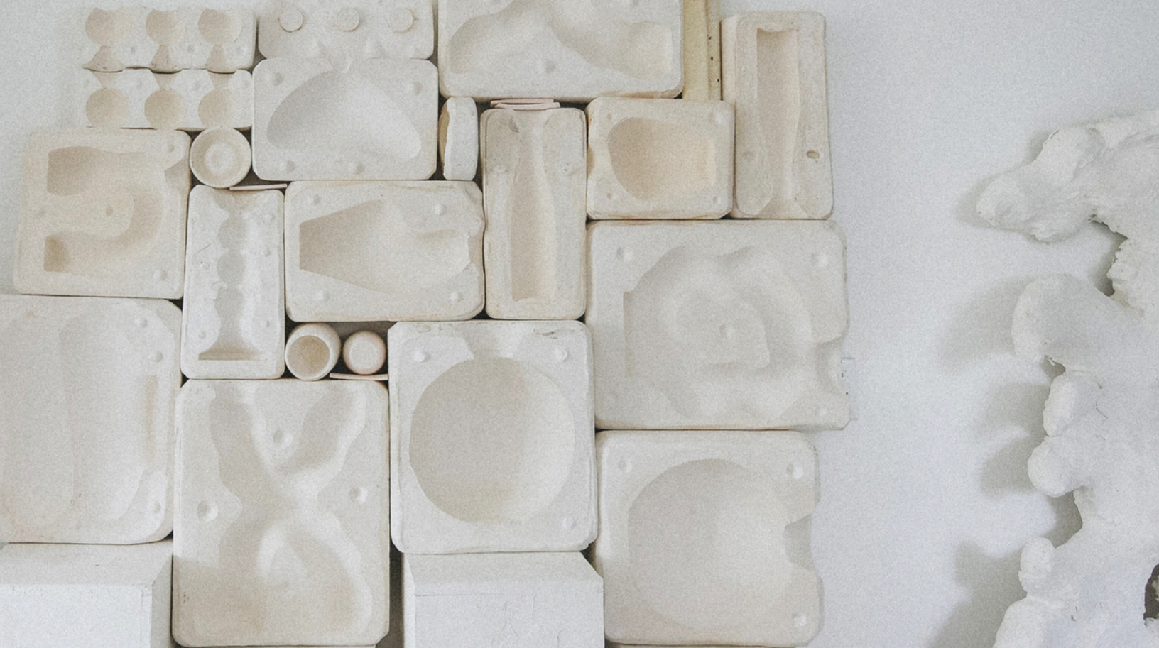
Original plaster molds made by Eve