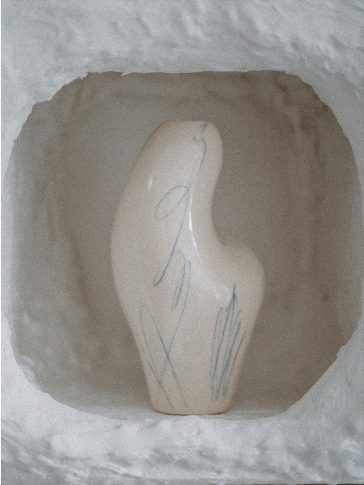
Mother & Child vase in the hand-drawn Sketchbook glaze finish