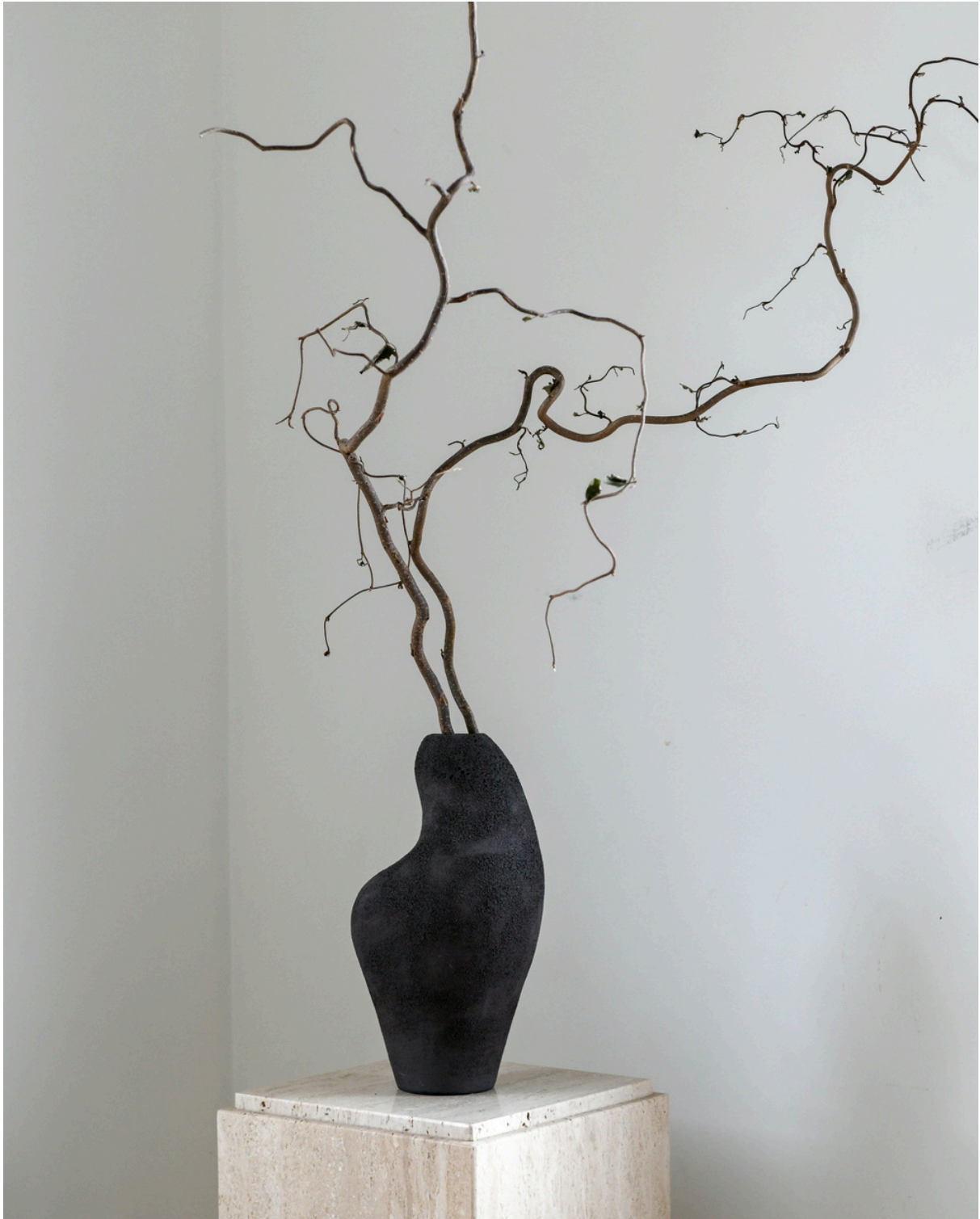
Mother & Child vase in textured Magma glaze finish