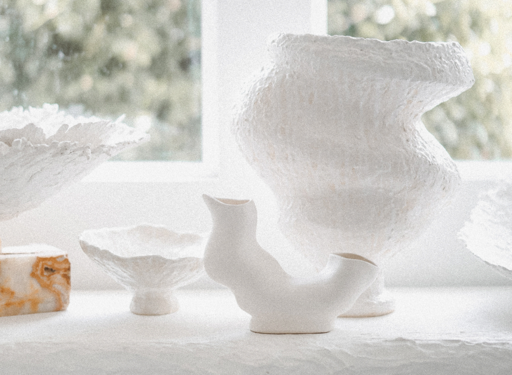
Genie vase in Matte White glaze finish, and custom vessels in Glossy Drip