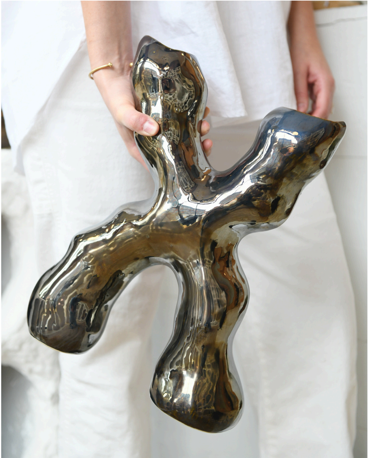
X vase in Deep Chrome glaze finish