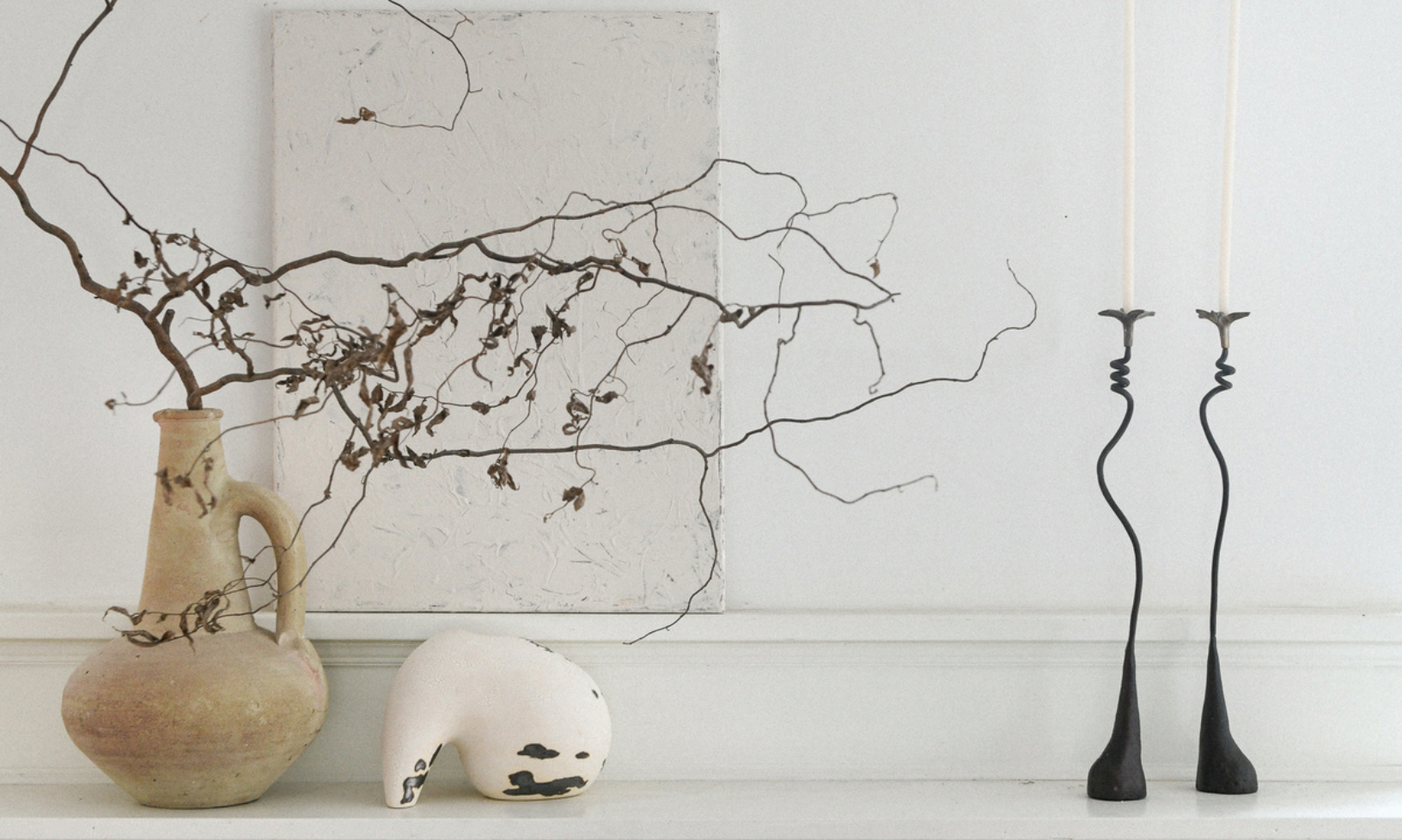
Teardrop vase in White Crackle and Vintage Gold glaze finish