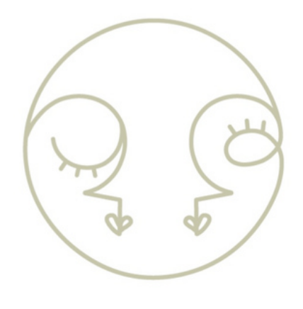
TWO FACED CERAMICS